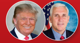
Donald Trump Mike Pence

We should repeal the 3-year, 10-year and permanent bars, which often force persons in mixed status [illegal alien-American children] families into ... either pursuing a green card ... or remaining in the shadows. We will support efforts by states to make DREAMers [those affected by the executive order called Development, Relief, and Education for Alien Minors] eligible for driver's licenses and in-state college tuition.