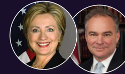
Hillary Clinton Tim Kaine